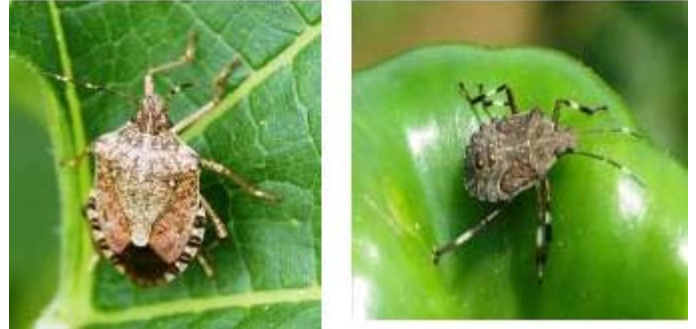
Fig. 2 Damage to various vegetables by Brown marmorated stink bug