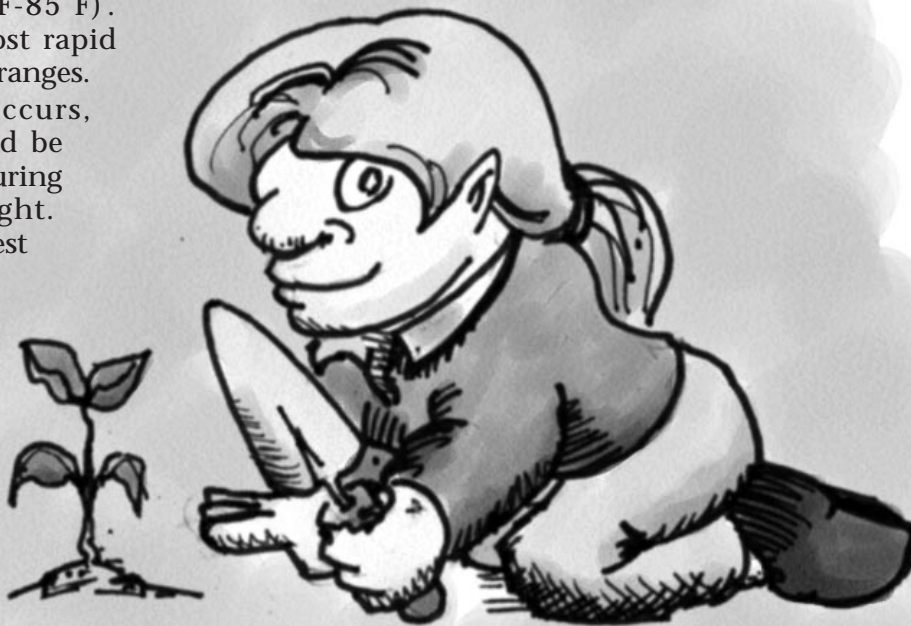
Plants should be moved to the garden at specific times determined by the type of plant.

Some commercial growers have recently begun using the "float system" for producing transplants. In this system, Styrofoam cell trays are floated on several inches of water in a greenhouse or outdoors. The water under the trays keeps the medium moist, and roots will grow down into the water which reduces care needed. A fine-textured soilless medium is required for the trays, and it must be pressed into the cells to assure uniform wetting. Air spaces in the cell, especially in the bottom, will result in the medium in the cell remaining dry which will delay or inhibit germination and growth. Gardeners could easily construct a float area by making a frame of 2x4's or 2x6's on edge and lined with a plastic sheet.